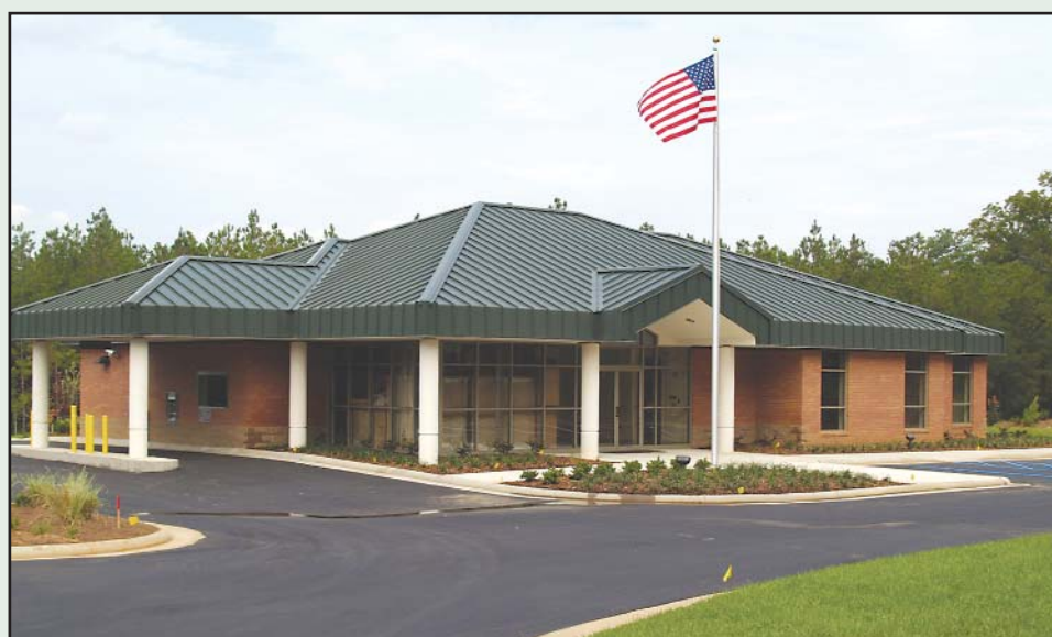
Southern Pine's new Hattiesburg branch office is scheduled to open in October. The branch brings drive-through service to Southern Pine members in the area. The branch office is located on the east side of U.S. 49 at the intersection of Miss. 42.

Southern Pine Electric Power Association opens a new branch office this month to serve the cooperative's members in the Hattiesburg area.