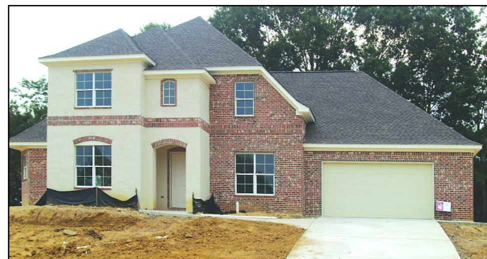
An Energy Star home nears completion in Noblewood Homes' new Glen Arbor residential development, located in the Brandon area on Louis Wilson Road.

For information, call (601) 694-2532 or (601) 694-2229. Be sure to bring a lawn chair.