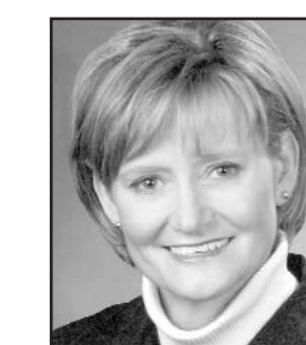
Sen. Cindy Hyde-Smith District 39: Lawrence, Lincoln and Simpson counties