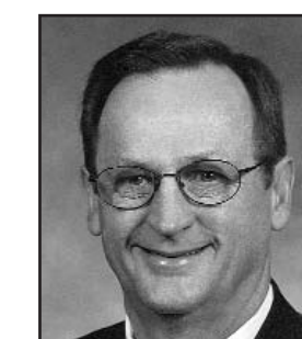
Sen. Dean Kirby District 30: Rankin County