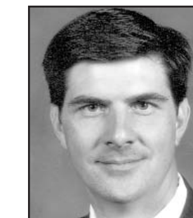
Sen. Stacy Pickering District 42: Jones County