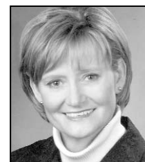
Sen. Cindy Hyde-Smith District 39: Lawrence, Lincoln and Simpson counties