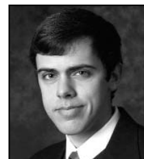
Rep. Toby Barker District 102: Forrest and Lamar counties