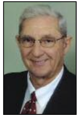
By Don Jordan General Manager

Under parts of the proposed legislation, Americans will be expected to switch to much more expensive renewable resources for generating electricity. Renewable resources provide less than 2 percent of the country's overall electricity