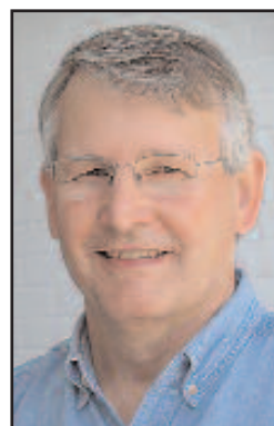
By Mike Bryant Marketing Representative

The following is a list of common electricity-users in your home. The chart estimates the average amount of energy used by each device. Use the chart to estimate your own energy bill and to determine ways to put cash back in your pocket each month.